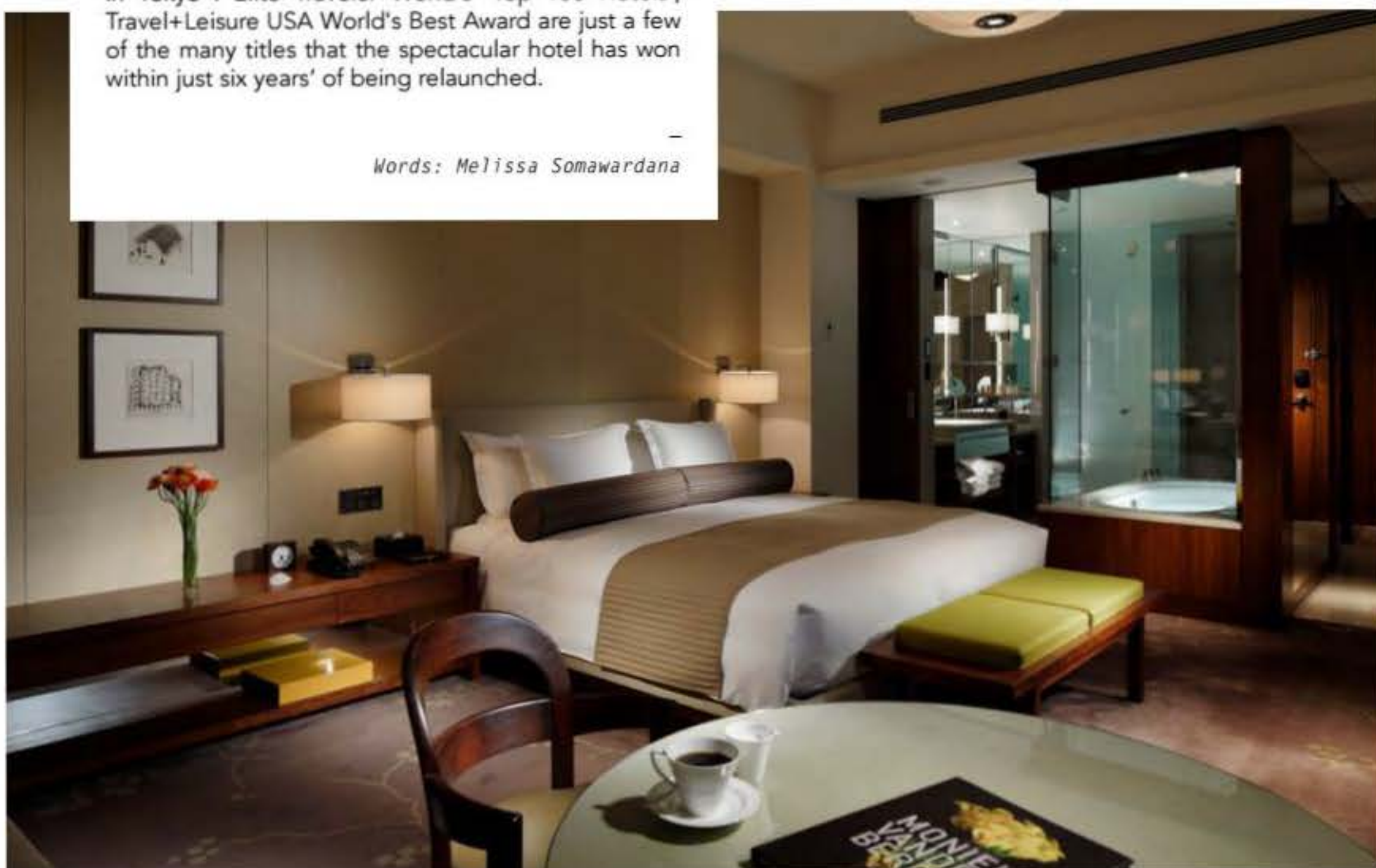
Palace Hotel Tokyo - Deluxe Room with Balcony