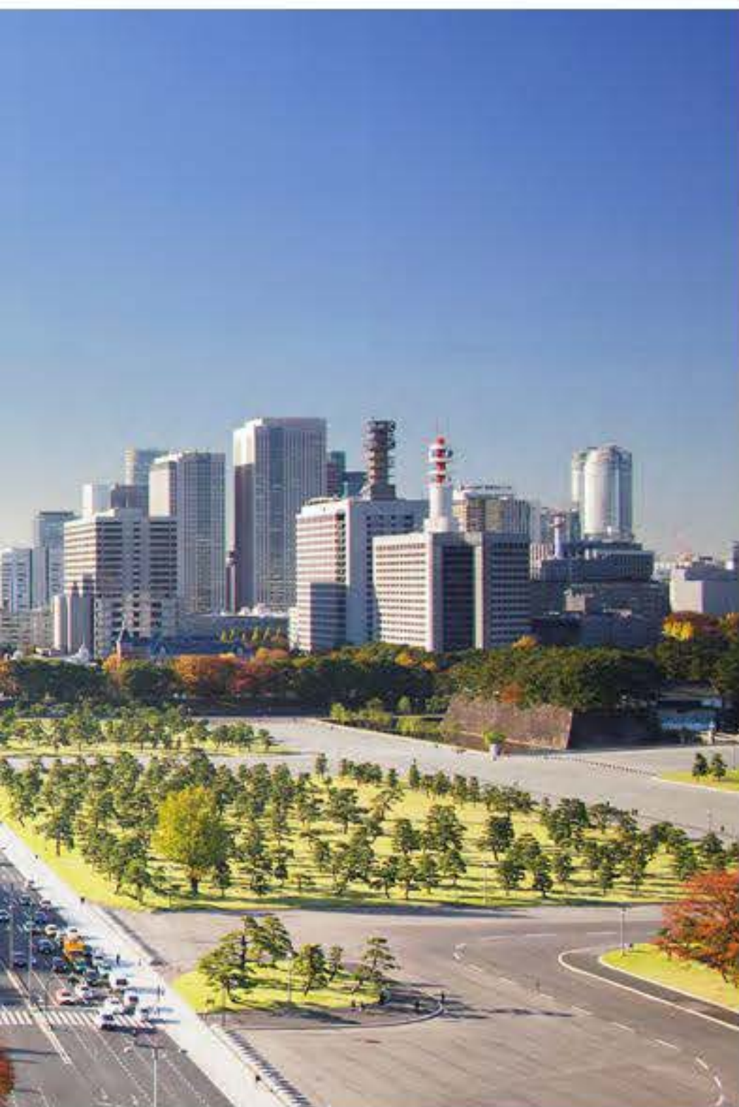
Palace Hotel Tokyo - Autumn Views