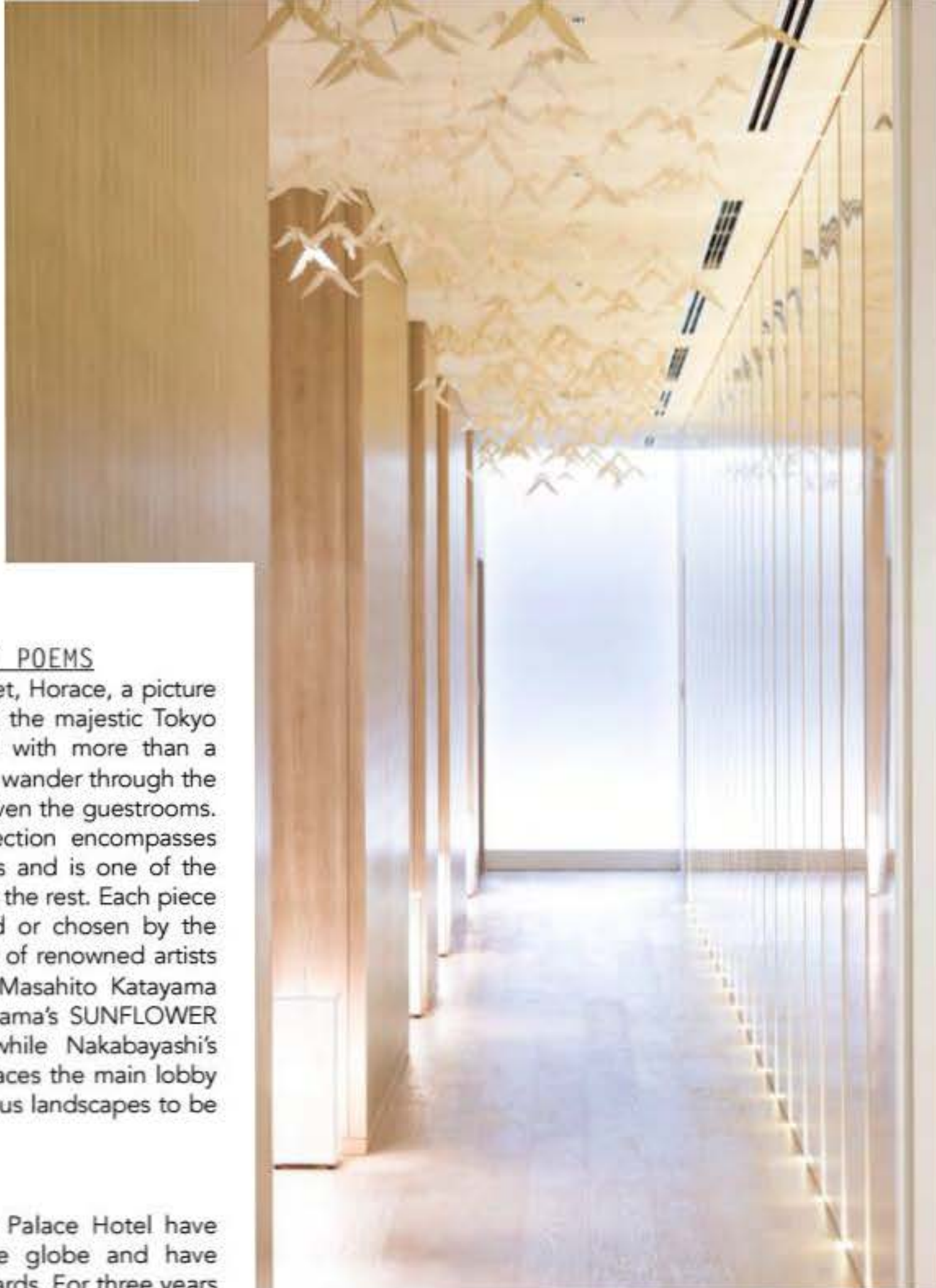
Palace Hotel Tokyo - evian SPA - Origami-Inspired Sculptural Installation