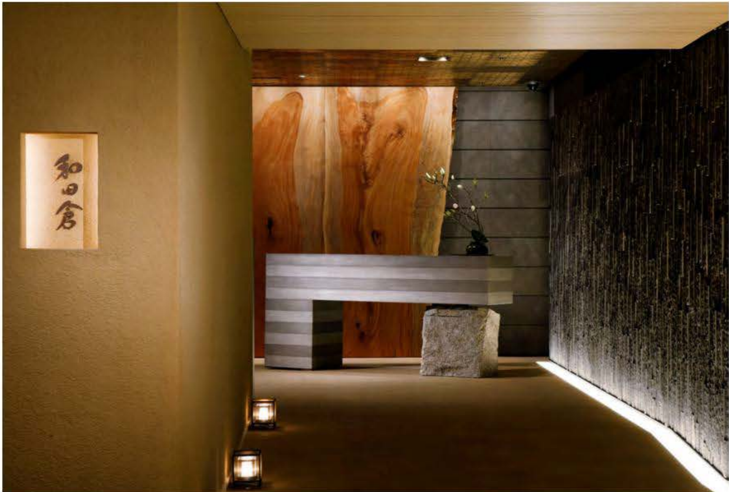
Palace Hotel Tokyo - Wadakura Restaurant Entryway