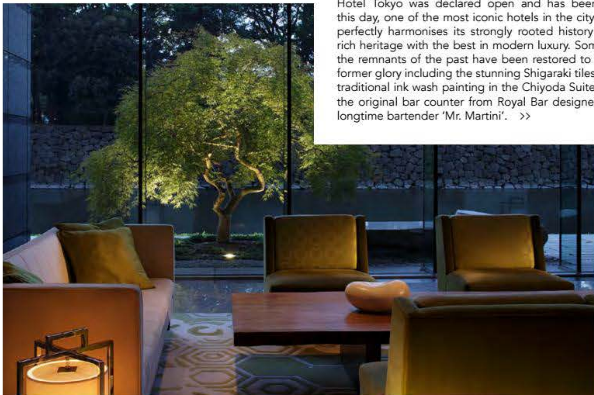
DPalace Hotel Tokyo - Lobby

The story of this grand hotel begins more than half-a-century ago with the birth of Hotel Teito that was once the Forestry Office of the Imperial Household. Owned and operated under the orders of the general headquarters of the Allied forces, it was created to meet the rising demand for accommodation in post-war Tokyo. In 1959, Hotel Teito was razed to make way for the Palace Hotel, 'a modern hotel for the modern era'. However, that too did not last long as the hotel closed in 2009 to prepare for a total rebuild from the ground up. Three years later, the Palace Hotel Tokyo was declared open and has been, to this day, one of the most iconic hotels in the city that perfectly harmonises its strongly rooted history and rich heritage with the best in modern luxury. Some of the remnants of the past have been restored to their former glory including the stunning Shigaraki tiles, the traditional ink wash painting in the Chiyoda Suite and the original bar counter from Royal Bar designed by longtime bartender 'Mr. Martini'. >>