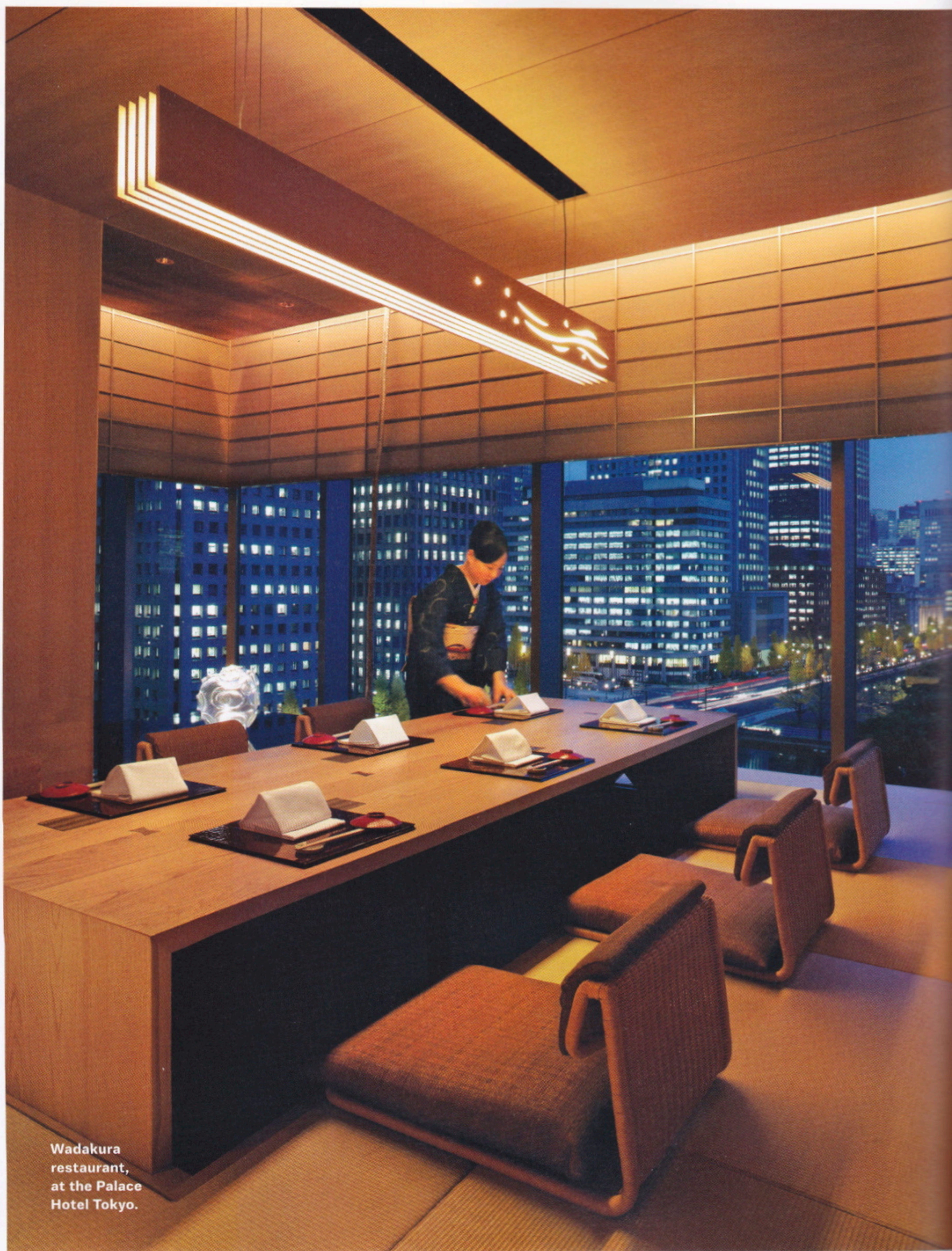
Wadakura restaurant, at the Palace Hotel Tokyo.