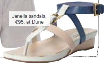
Janella sandals, €95, at Dune