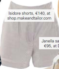
Isidore shorts, €140, at shop.makeandtailor.com