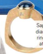
Sapphire and diamond gold ring, €5,500, at amoc.ie