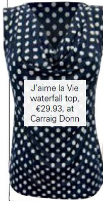
J'aime la Vie waterfall top, €29.93, at Carraig Donn