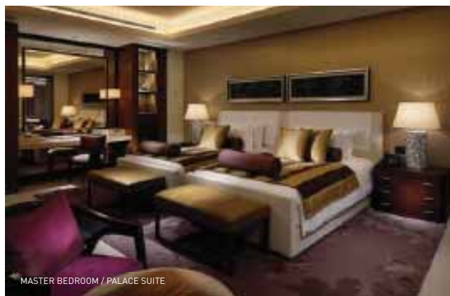
MASTER BEDROOM / PALACE SUITE