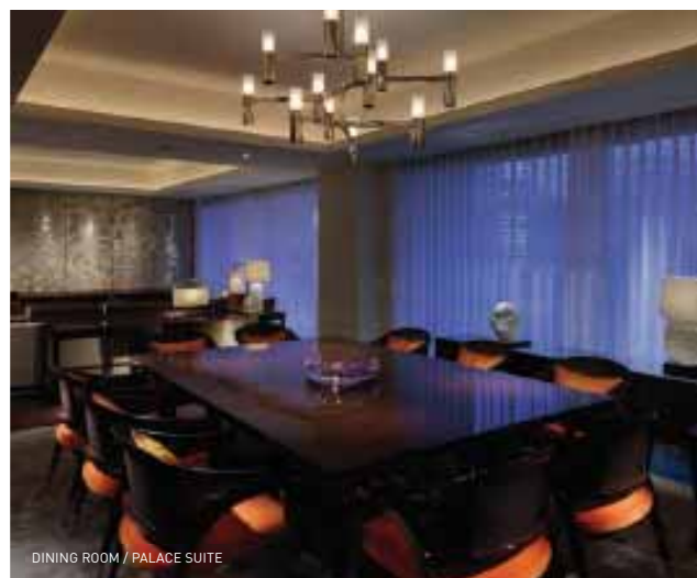
DINING ROOM / PALACE SUITE