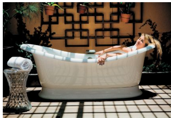
A sudsy brew bath (above) rates right up there with imbibing a tall cold one (left).