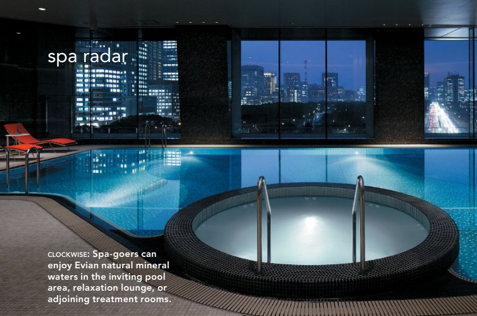
CLOCKWISE: Spa-goers can enjoy Evian natural mineral waters in the inviting pool area, relaxation lounge, or adjoining treatment rooms.